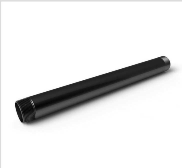
Threaded and Painted