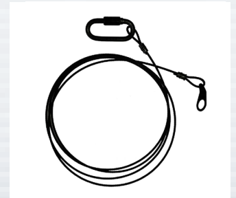
Safety Cable Included