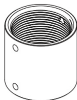
1-1/2" NPS Pipe Coupler