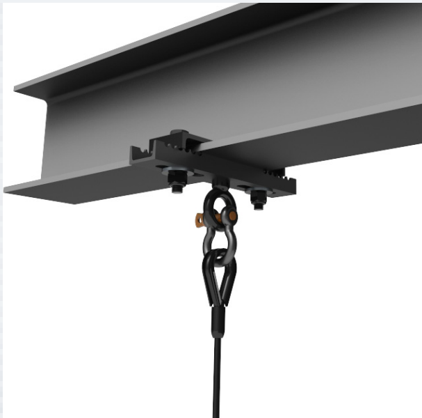
Swiveling Hang Point