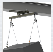
Tilt Cable Kit Rigging Option