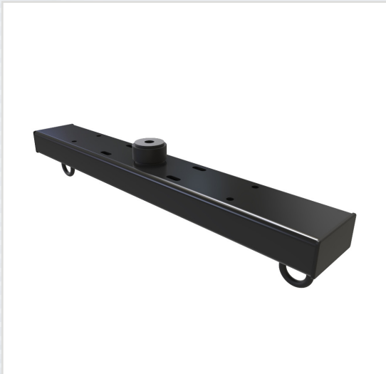
Pan & Tilt from I-Beam

Mount or rig loudspeakers from this rotating arm and get a full 360 degrees of horizontal aiming from a selected Beam Clamp. This load-rated Swivel Arm pairs with a variety of steel and wood beam clamps. It's mounting pattern mates with our AJ Adjustable Series U-Brackets. Eye Bolts are included for rigging. For rigging options, choose the size of Swivel Arm based on the selected speaker size and orientation. Vertical orientations require Swivel Arms 2-4" longer than the width of the speaker. Horizontal orientations require arms 2-4" longer than the height of the speaker.