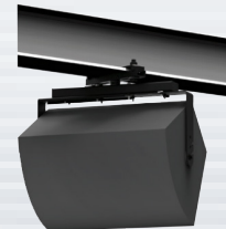
U-Bracket Mounting Option

Mounting options require that the Swivel Arm is 2-4" less than the speaker dimension.