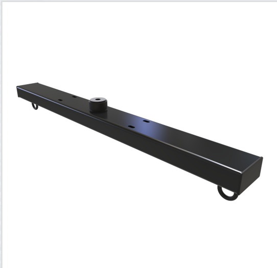
Pan & Tilt from I-Beam

Mount or rig loudspeakers from this rotating arm and get a full 360 degrees of horizontal aiming from a selected Beam Clamp. This load-rated Swivel Arm pairs with a variety of steel and wood beam clamps. It's mounting pattern mates with our AJ Adjustable Series U-Brackets. Eye Bolts are included for rigging. For rigging options, choose the size of Swivel Arm based on the selected speaker size and orientation. Vertical orientations require Swivel Arms 2-4" longer than the width of the speaker. Horizontal orientations require arms 2-4" longer than the height of the speaker.