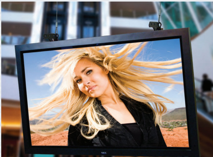
Low Profile Rigging Kit

Fly LCDs out in front of your audience from HoverPro, when wall mounting LCDs or floor supported kiosks aren't practical. Save space and permanently display video content above your audience by suspending and aiming LCD monitors from any overhead structure.