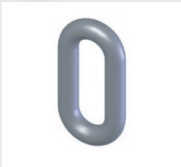
Weldless End Link

Weldless endlinks are produced from a single piece of metal so there is no chance for weld failure. This high strength load-rated link is ideal for use in coupling multiple span sections together, such as wire rope and rigging chain. Multiple sections of wire rope and rigging chain link together, using shackles. Its oval shape is designed for in-line use and is not to be side loaded.