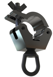
Eye Nut Kit

*The working loads of both of the MC-EN-KT and the MC-030 may exceed the load strength of the overhead structure they are suspended from.