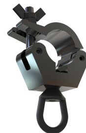
Eye Nut Kit

*The working loads of both of the MC-EN-KT and the MC-030 may exceed the load strength of the overhead structure they are suspended from.