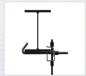
I-Beam with Clamp

This beam clamp model provides a fast, easy and safe way to rig direct loads, bridles and hitches from overhead and a hand wrench is all that is required to secure this clamp. The beam flanges must be parallel to the floor.