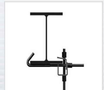
I-Beam with Clamp