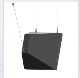
CC-096 Rigged Speaker

The Steerables™ Pull back and coupler cable kit serves as a pullback and coupling device for fl yable loudspeakers and can be used in a wide range of rigging applications. It provides an easy and infi nitely adjustable feature for loudspeakers and other objects weighing up to 220 lbs/134 kg.