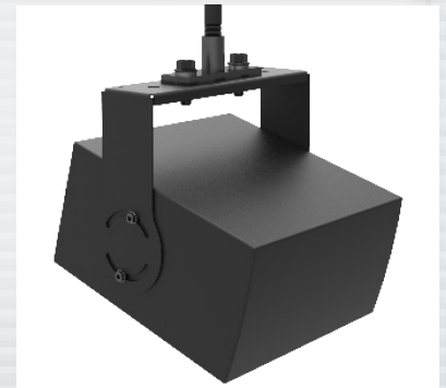
Ceiling Mounted with MP-500NPT-TA