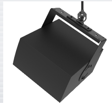
Ceiling Mounted with MM-3RDX-18

Adaptives UB-705 U-Bracket supports the JBL models LSR 705P and LSR 705i and provides 110° of tilt functionality. It's mounting hole pattern allows it to either be directly mounted to the wall and more options can be mounted to a number of other Adaptive ceiling attachments.