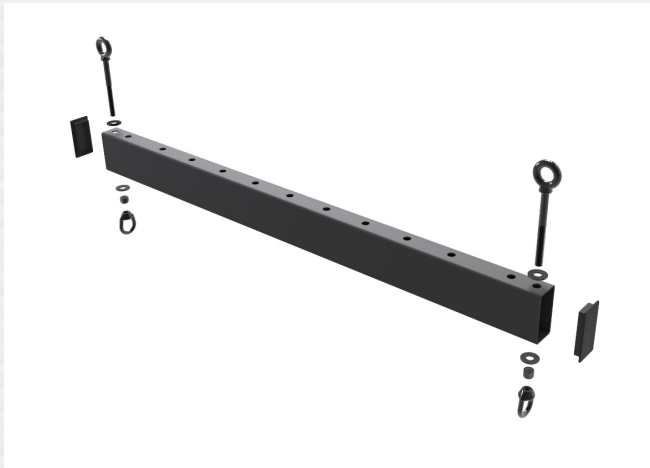
Rigging Beam with Lifting Points

Use this rigging beam as one of several components to build a load-rated rigging grid assembly. Choose from several pre-engineered rigging beams, joiners and suspension options that allow you to design and assemble your own grid in dozens of different configurations (see GridLink data sheet). This rigging beam may also serve as a spreader bar to suspend objects between two trusses.